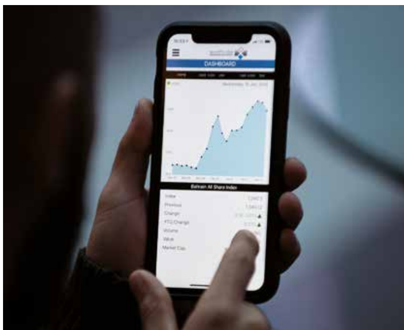
March 2017 marked the launch of an alternative market aimed at providing financing to growth-stage firms

In June 2018 Bahrain Clear announced plans to issue investors pre-paid cards, to which dividend payments will be transferred, allowing them to withdraw