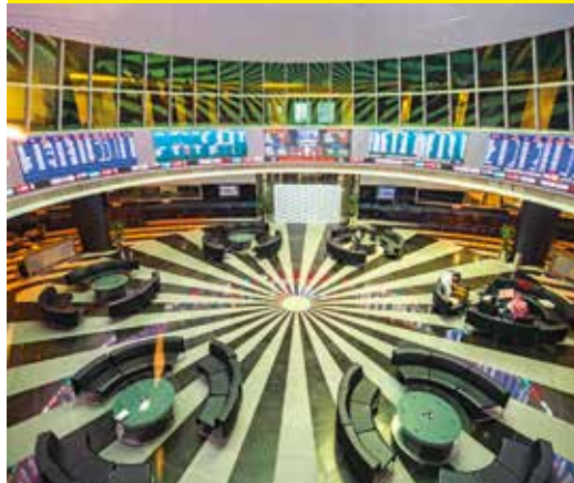
The bourse is being granted some responsibility for its own oversight