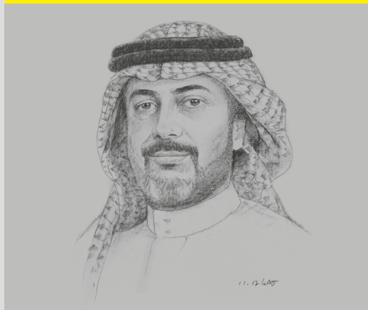
Sheikh Khalifa bin Ebrahim Al Khalifa, CEO, Bahrain Bourse