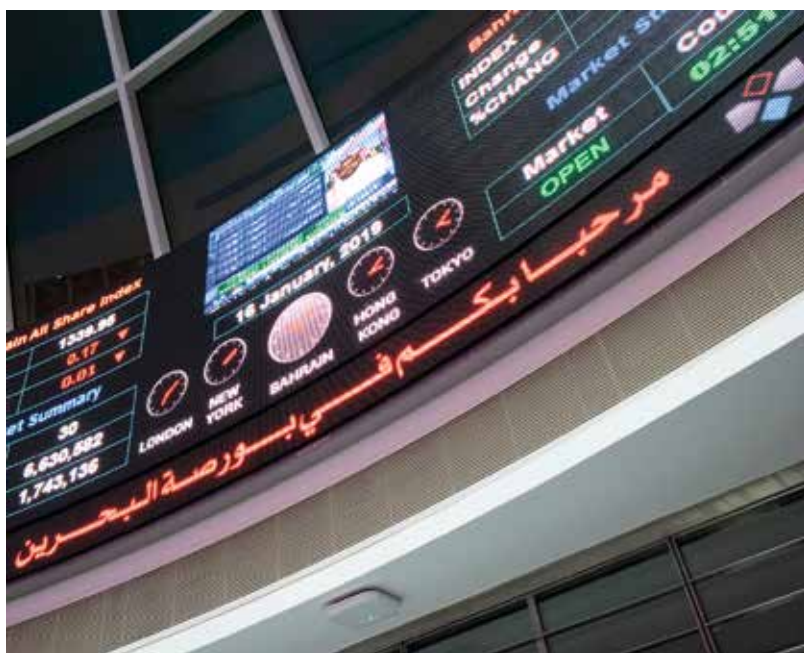
Several firms on the kingdom's exchange are cross-listed on the bourses of other countries in the region

The five biggest firms, which are four banks and one aluminium producer, account for more than half of the exchange's total market capitalisation.